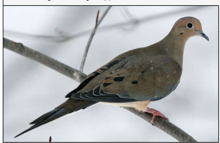
Page 4 - The Fledgling, March - May 2020