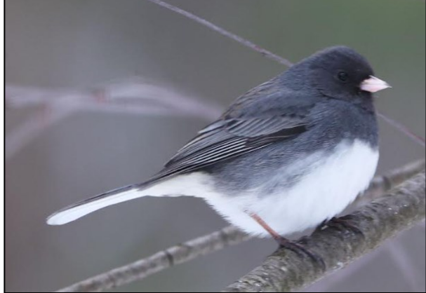
Page 8 - The Fledgling, September — December 2022