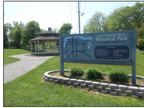
Top, the South Glens Falls Historical Park sign indicates historical areas of interest along the Betar Byway.

Birders can encounter a number of dog-walkers and bicyclists along this paved trail, but not enough to be a hazard. Pets must be leashed at all times.