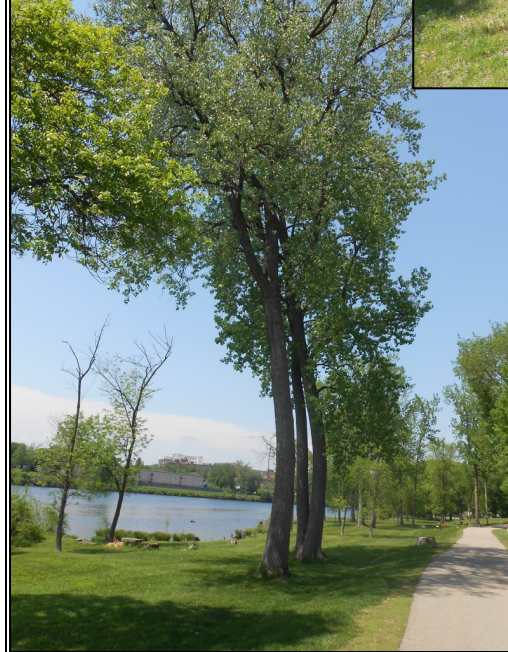
Page 4 - The Fledgling, September — December 2022

Left: In spring, Baltimore Orioles frequently nest in the cottonwood trees along the river. Their pendulous nests look like old gym socks hanging from the tips of branches.