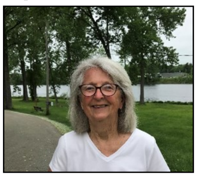
Page 2 - The Fledgling, September — December 2022

Collins enjoys writing the column "About Wildflowers" for the quarterly Southern Adirondack Audubon Society newsletters and looks forward to bird and wildflower walks next spring.