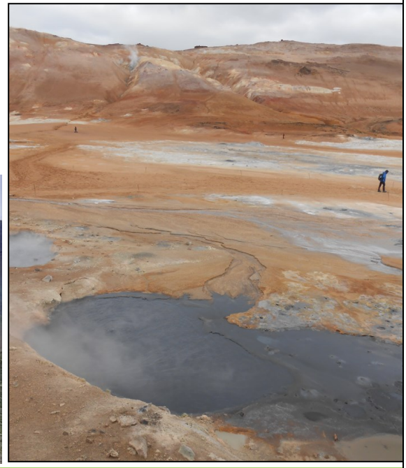
Page 7 - The Fledgling, September — December 2022