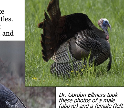
(above) and a female (left) Wild Turkey.

When faced with danger, females usually fly and males usually run from the threat, reports All About Birds. Wild Turkeys can trot up to 25 miles per hour and fly as fast as 55