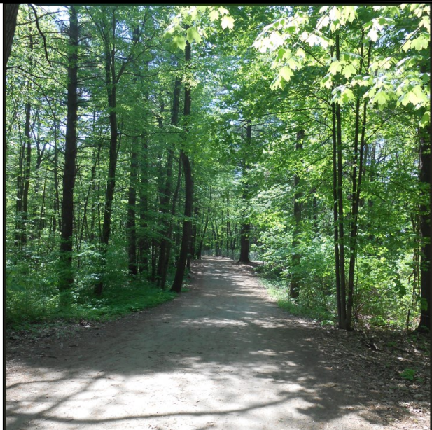
Above: Betar Byway's upper trail offers shaded paths and views.